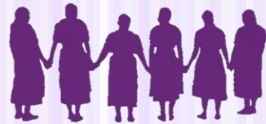
Supporting Our Sisters

We invite you to make an undesignated gift which will allow us to direct funds where they are needed most. Learn more and give online today at ncpguatemala.com/donate or by using the ECHO Giving form . Thank you for supporting our sisters!